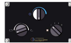
Switch recirculation Switch Fan